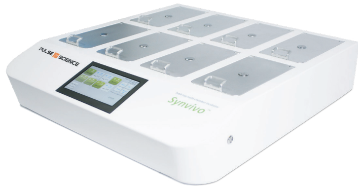
Benchtop Multi-chamber Incubator