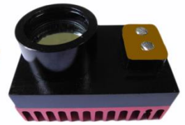
LED excitation block