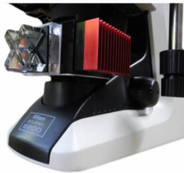
X mirror for changing excitation light